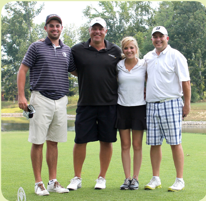
First Place Team: M&M Amish Cabinets