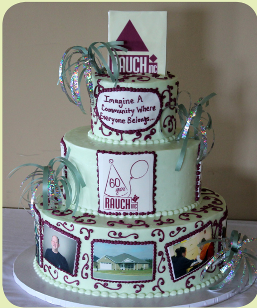
The incredible birthday cake by New Albany's Sweet Stuff Bakery

Rauch's fifth annual golf scramble was another record setter. We're thrilled to share that the event generated nearly $15,000 in net proceeds after expenses to provide programs and services supporting children and adults with disabilities in our community—a 19% increase in profits over the 2012 event. The event hosted 120 players, 30% more than 2012 and our highest attendance ever. We have many to thank for this tremendous success; a listing of our generous sponsors can be found to the right.