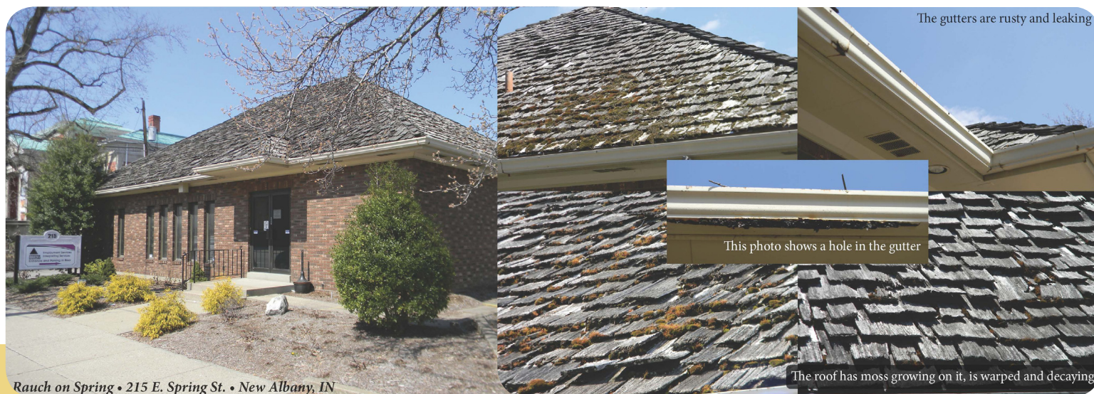
Rauch on Spring • 215 E. Spring St. • New Albany, IN