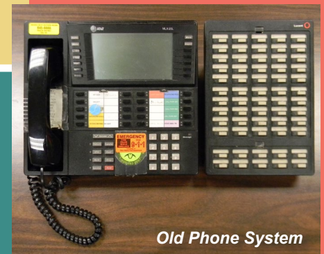
Old Phone System

Rauch would like to thank all the contributors to the Building Blocks Campaign that made this upgrade and so much more possible.