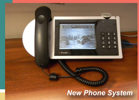
New Phone System

Visit www.rauchinc.org for a list of current job openings and upcoming events or to sign-up to receive E-MAGINE, our monthly e-newsletter.