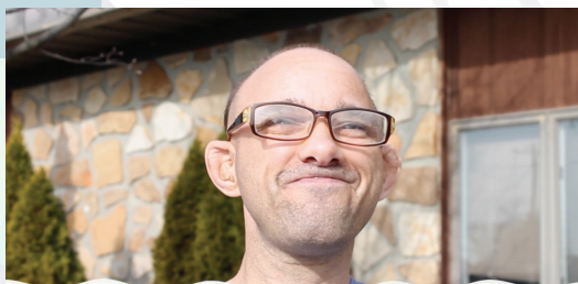
Can you help?

Having never asked something of this magnitude of the Imagine Awards attendees, Rauch had modest expectations. If funds to buy two of these five vehicles were acquired, the staff and board members would have been delighted.